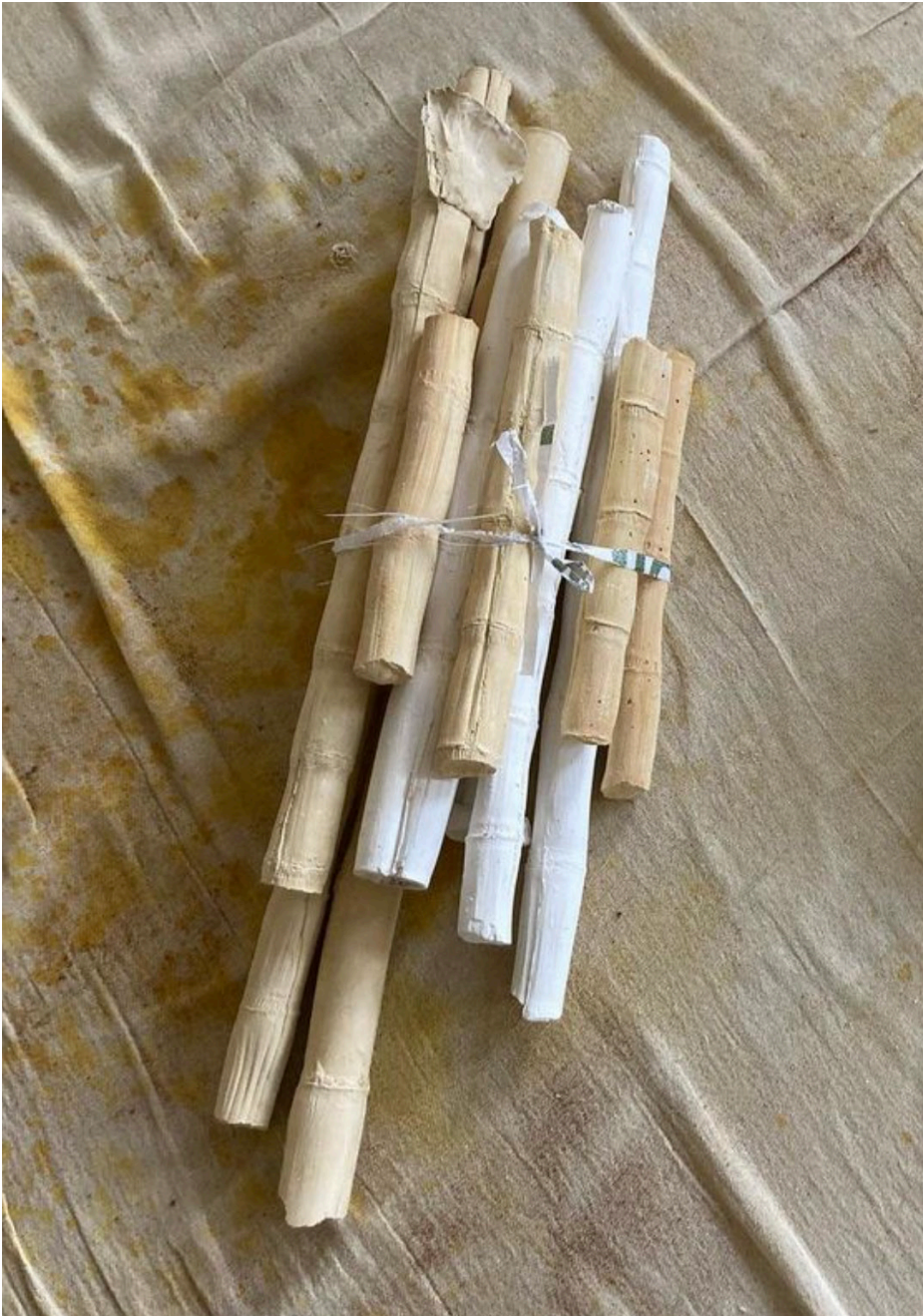
Shivanjani Lal, Ganna ki khet (small) (2021), Plaster and haldi (turmeric) (sourced Deptford, London), Dimensions variable