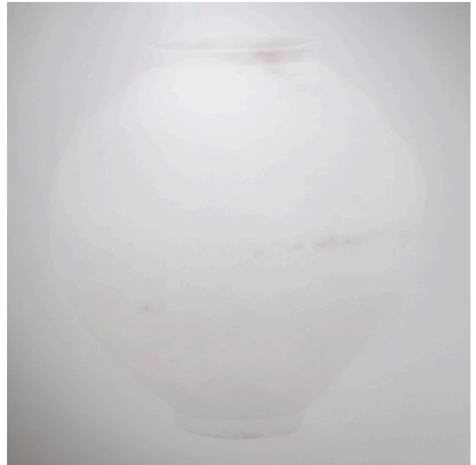
Sunghoon Yang, Memory I (2015), Oil on canvas, 130 x 130 cm

Painted in a colour similar to that of the background, the ceramics seem to fade at their edges, as though within a mist. Adding to the mystery of the painting, this hints at the idea of fading memories, and the continued passage of time.