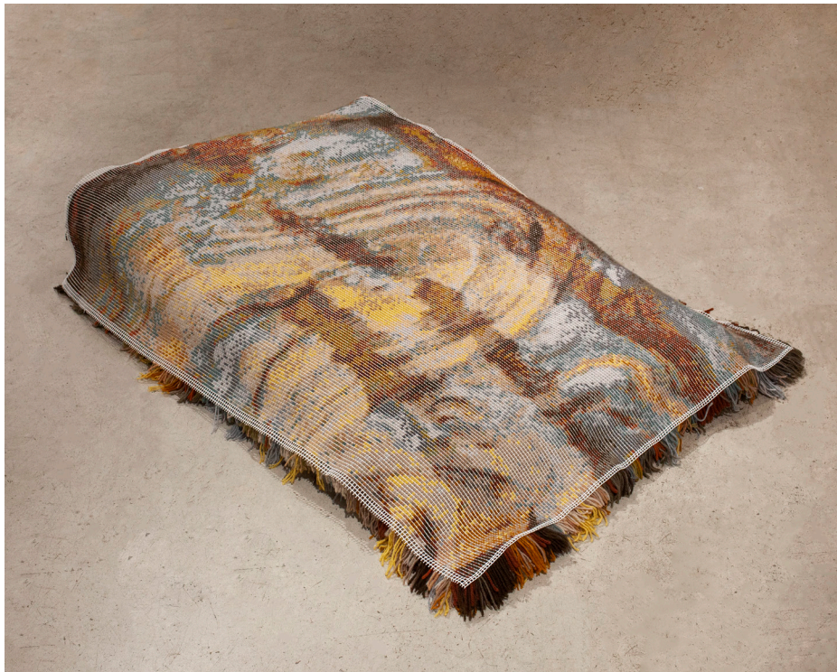
Seungwon Jung, Ductile Deformation (2021), Hand knotted tapestry, 98 x 148 cm