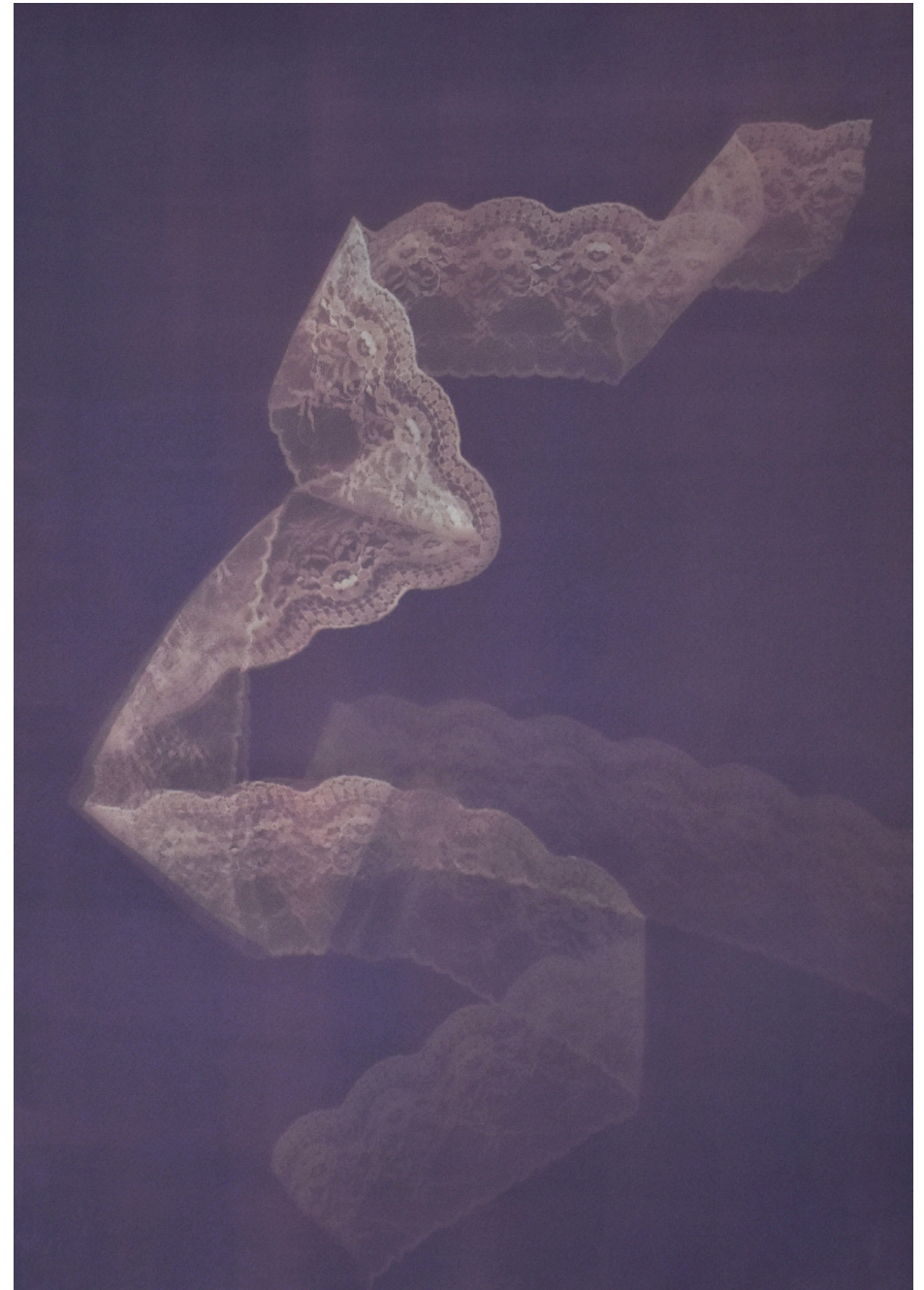
Yang-En Hume, Fossil 4 (2019), Solar-sensitive ink on watercolour paper, 59 x 42 cm

In Fossils , Hume uses solar-sensitive ink to create a series of photograms, each print featuring a piece of lace sourced from flea markets. They highlight untold histories, drawing attention to the labour of nameless women who manufactured the lace, while celebrating the often overlooked domestic crafts.