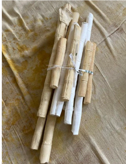
Shivanjani Lal, Ganna ki khet (small) (2021), Plaster and haldi (turmeric) (sourced Deptford, London), Dimensions variable