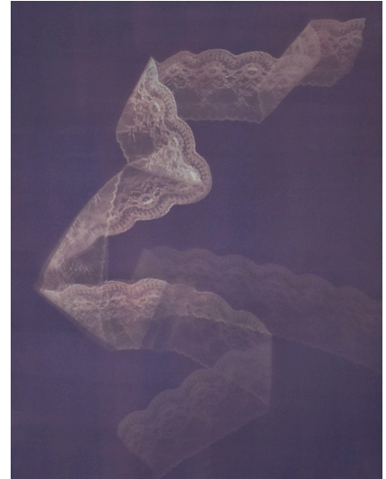
Yang-En Hume, Fossil 4 (2019), Solar sensitive ink on watercolour paper, 59 x 42 cm

No 20 Arts 20 Cross Street London N1 2BG