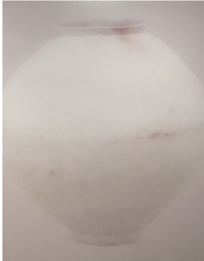
Sunghoon Yang, Memory I (2015), Oil on canvas, 130 x 130 cm

YANG-EN HUME | SEUNGWON JUNG | SHIVANJANI LAL | SUNGHOON YANG