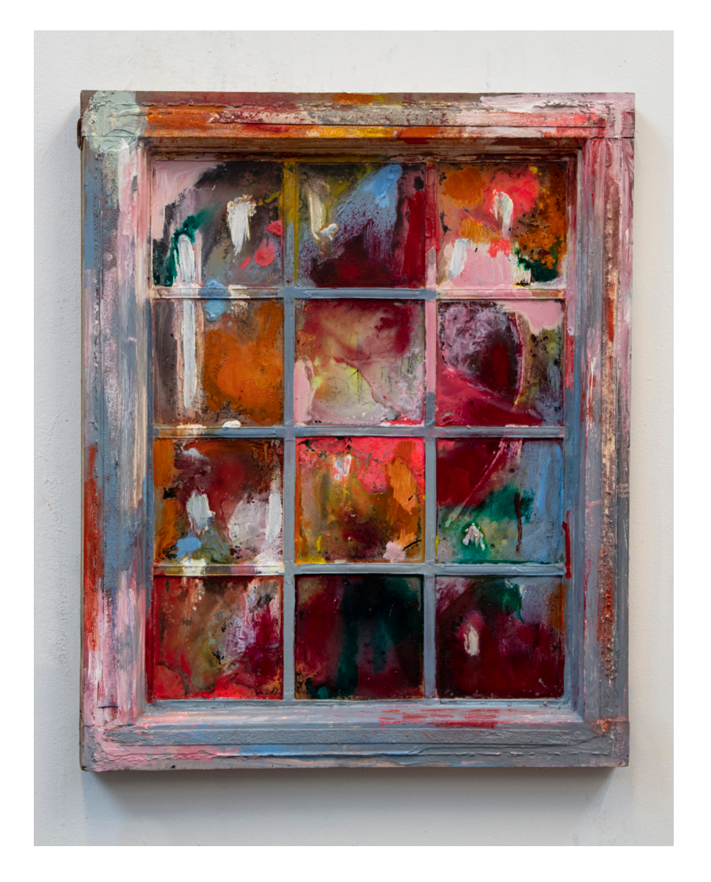
Jo Dennis, From Home 01 (2021), acrylic, oil and spray paint on found object, glass, lead and wood, 59 \times 48 cm (framed)

Jo connects the ideas relating to the home, surface, looking through, inside looking out and visa versa. Windows are portals, they are our everyday and invite us to look and see, framing the world on the other side. They function both for us to peer through but also act as a barrier between what is in view and our own position.