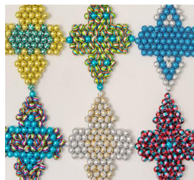
Enrica Borghi Busto (2017)