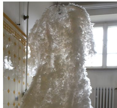
Carlotta Brunetti Detail of Foam (2017)