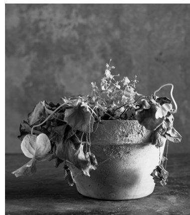
Paolo Minioni Still life cyclamen (2005)

Photography also finds its place in this exhibition. The work of Paolo Minioni captures the vibrant aura of abandoned objects: what remains of a little plant that does not want to die, or the terracotta of empty vases that still brim with life. Often overlooked, they still have stories to tell, things to recount. The lights and shadows in his black and white photographs might suggest a scarce inner resilience of things that actually represent their strength.